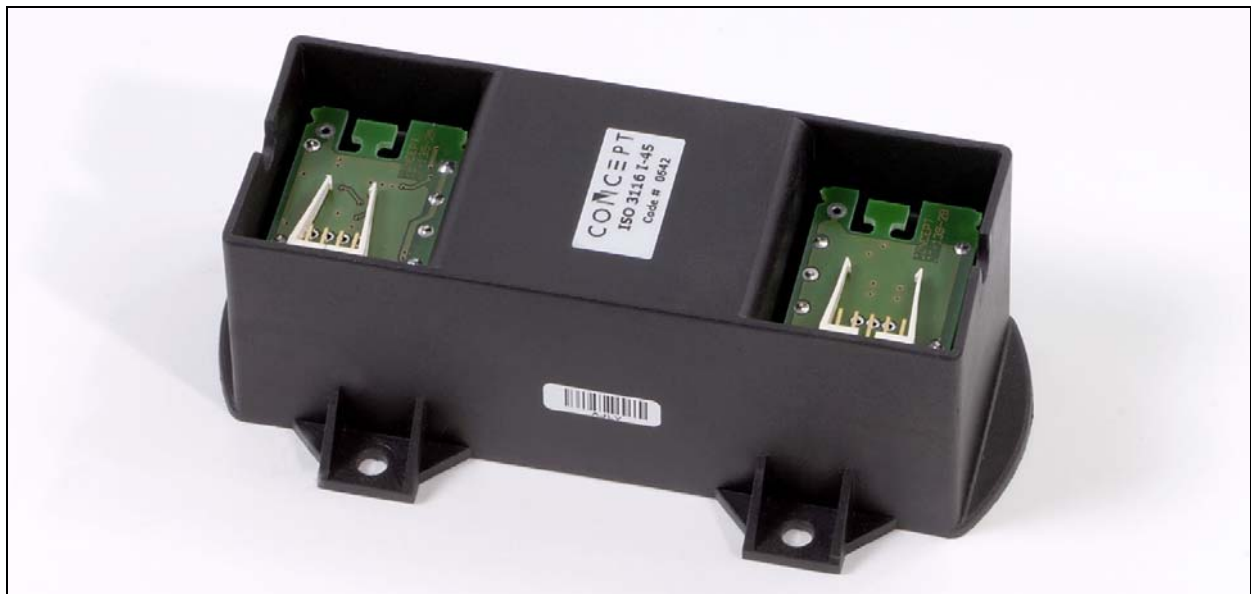
Fig. 1 Power Supply ISO3116I

For drivers adapted to various types of high-power and high-voltage IGBT modules, refer to www.IGBT-Driver.com/go/plug-and-play