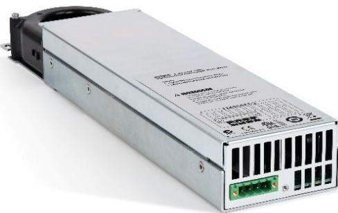
Figure 6b. The basic series

The Keysight N6730, N6740 and N6770 Series of DC power modules provide programmable voltage and current, measurement and protection features at a very economical price, making these modules suitable to power the DUT or to provide power for ATE system resources, such as fixture control.