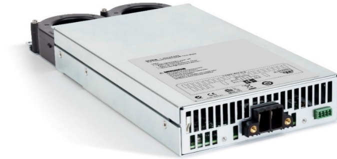
Figure 6c The N6753A – N6756A High performance and the N6763A – N6766A Precision DC power modules each occupy two module slots within the mainframe. All other modules occupy 1 module slot.

For details on these products and how they can be used for applications including battery drain analysis and function test, visit www.keysight.com/find/N6780 and download the N6780 Series Source/Measure Units (SMUs) for the N6700 Modular Power System Data Sheet , literature number 5990-5829EN