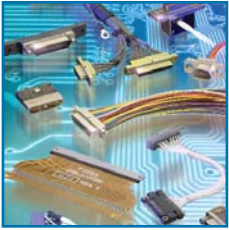
Microdot Connectors and Cables