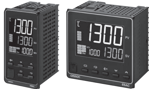
48 × 96 mm E5EC