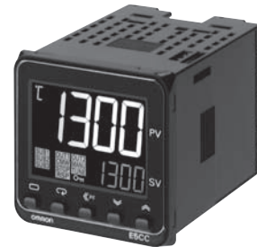
48 × 48 mm E5CC

Refer to your OMRON website for the most recent information on applicable safety standards.