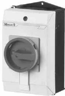
for wall installation