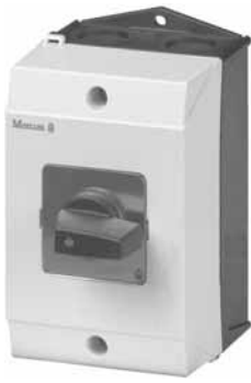
for wall installation

Third-party accessories from Möller Electric GmbH