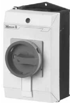
for wall installation