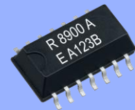
RX8900SA (10.1 × 7.4 × 3.3 mm)