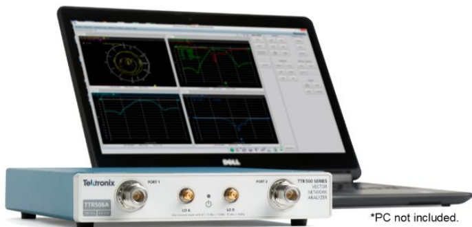
*PC not included.

An independent RF source and three RF receivers for each port of the TTR500 enable you to take high-accuracy magnitude and phase measurements with a 1-port or 2-port device under test (DUT). Use the TTR500 to perform complete S_{11} , S_{12} , S_{21} , and S_{22} measurements of the DUT and display data in a variety of formats (see measurement functionality table).