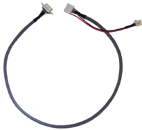
Figure 3: ESCCPC5V

The most common cable choice for the any GTT display, the Extended Communication/ Power Cable offers a simple connection to the unit with familiar interfaces. A DB9 and floppy power header provide all necessary input to communicate to and power your display.