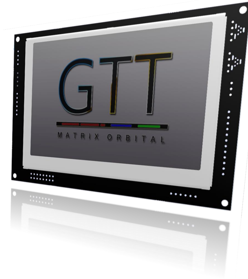
Figure 1: The GTT50A Display