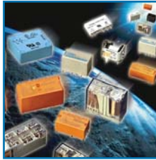
Schrack PCB Relays