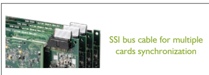
SSI bus cable for multiple cards synchronization

Terminal Board with One 37-pin D-sub Connector and DIN-Rail Mounting (Cables are not included.)