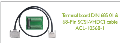
Terminal board DIN-68S-01 & 68-Pin SCSI-VHDCI cable ACL-10568-I