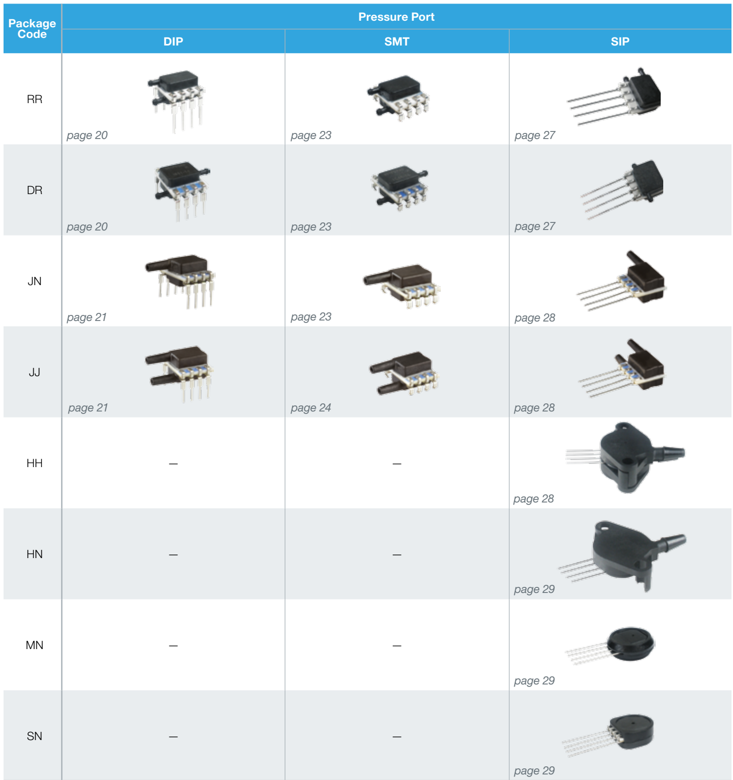
Figure 5. All Available Standard Configurations (Continued; dimensional drawings on pages noted below.)