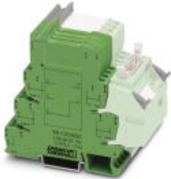
VARIOFACE feed-through terminal block (3-wire connection), for PLC-RELAY actuator series

Please be informed that the data shown in this PDF Document is generated from our Online Catalog. Please find the complete data in the user's documentation. Our General Terms of Use for Downloads are valid ( http://phoenixcontact.com/download )