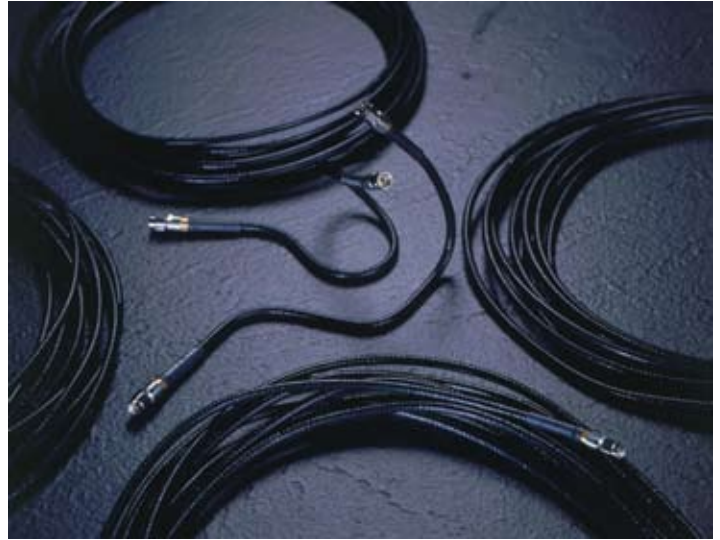
GORE™ RF Jumper Assemblies are available in a variety of lengths

The small bend radius makes these assemblies easier to route in tight spaces and a cable bend radius as small as 0.40 in (10.2 mm) is achieved with no degradation in electrical performance.