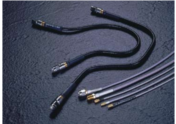
Interconnect solutions include GORE™ RF Jumper Cable Assemblies and High-Density Assemblies

Gore's ePTFE insulation with a low dielectric constant of 1.4 offers: