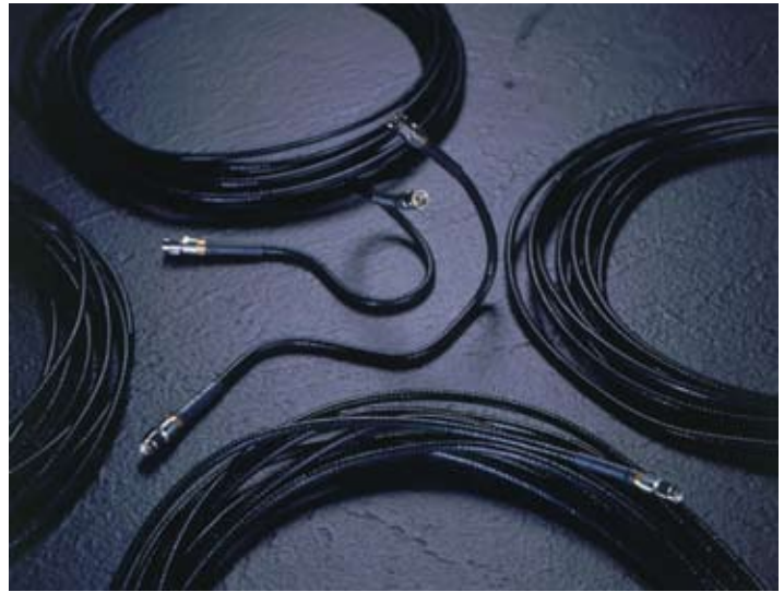
GORE™ RF Jumper Assemblies are available in a variety of lengths

The small bend radius makes these assemblies easier to route in tight spaces and a cable bend radius as small as 0.40 in (10.2 mm) is achieved with no degradation in electrical performance.