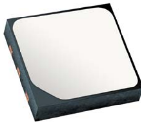
Figure 7. Si7021 with Factory-Installed Protective Cover

*Note: All trademarks are the property of their respective owners.