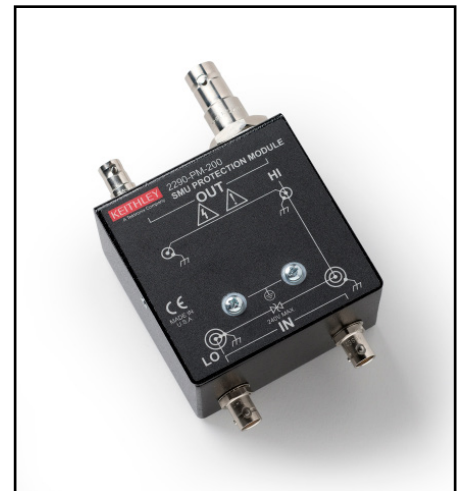
The Model 2290-PM-200 Protection Module protects low voltage measurement equipment from voltages greater than 200V.

When low voltage measurement instrumentation is used in the high voltage circuit, the protection module safely clamps the voltage across the instrument to a maximum value of 200V even when a device under test (DUT) breaks down. Thus, a Series 2290 Power Supply, Model 2290-PM-200 Protection Module, and Keithley accessories provide all the elements for building a safe, high voltage test environment.