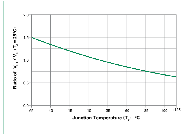
Figure 4: Normalized DC Gate Trigger Voltage for All Quadrants vs. Junction Temperature