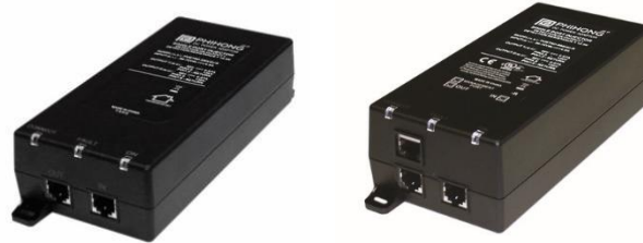
Shown here in standard on the left and with NIC option on the right