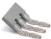
Insertion bridge, Number of positions: 3, Color: gray