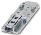
Universal DIN rail adapter