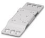
Universal wall adapter