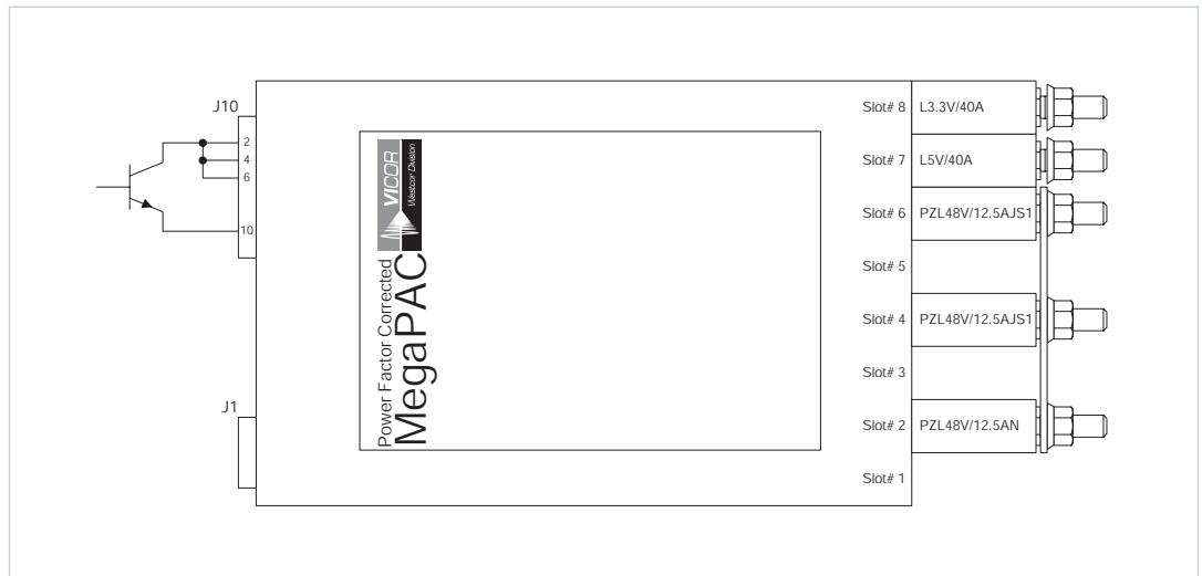
Figure 6 Enable / disable control of Maxi Arrays

Note: For single output power supply configurations, the simplest method of remotely enabling and disabling the output is to use the General Shutdown (GSD) function.