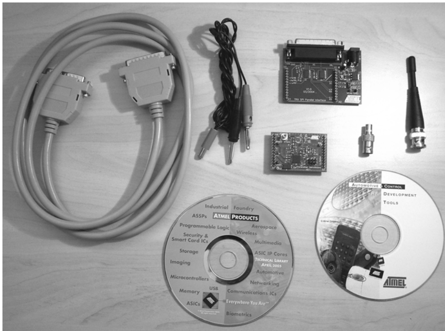
Figure 2-1. Kit Contents

The transceiver kit consists of a transceiver base station board, an SPI2LPT interface board, a DC supply cable, a parallel port cable, and a CD-ROM with the appropriate software, as depicted in Figure 2-1. The transceiver board and the SPI2LPT interface board have to be ordered separately.