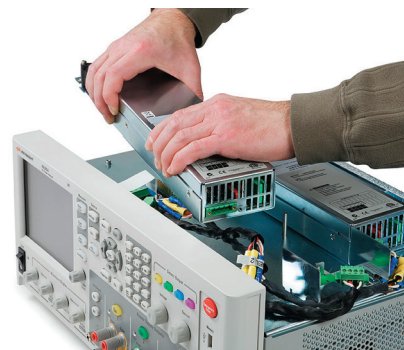
Figure 2. DC power modules are easily installed into the N6705 DC power analyzer mainframe.