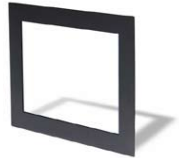
Optional Industrial Flange Bezel (Part Number: 5021104)