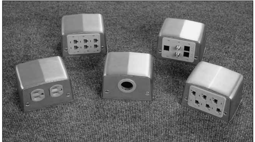
525 Series Fittings provide single service wiring solutions.

525 Series Service Fittings are made from die-cast aluminum with a brushed satin finish. Each pedestal provides a single service, with multiple fittings required for two or more services. This line of fittings is ideal for use in schools, commercial office spaces and in labs.