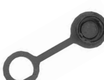
Dust Cap 16295