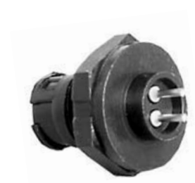
P/C Tail Panel Mount 172XX-XXB-XXX Matching Mates: • Cable Pin 1628X-XPB-XXX • Cable Socket 1628X-XSB-XXX