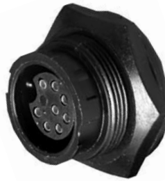
Panel Mount 4X8X-XXB-XXX Matching Mates: • Cable Pin 3X8X-XPB-XXX • Cable Socket 3X8X-XSB-XXX