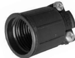
Mechanical Back Shell (Style #5)