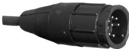
Cable to Cable