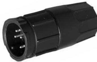
Cable to Cable 5X8X-XXB-XXX Matching Mates: • Cable Pin 3X8X-XPB-XXX • Cable Socket 3X8X-XSB-XXX