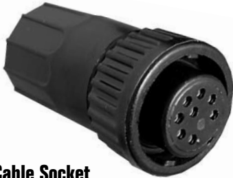
Cable Socket 3X8X-XSB-XXX Matching Mates: • Cable-Cable 5X8X-XPB-XXX • Panel 4XXX-XPB-XXX