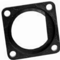
Square Flange Adapter 4296