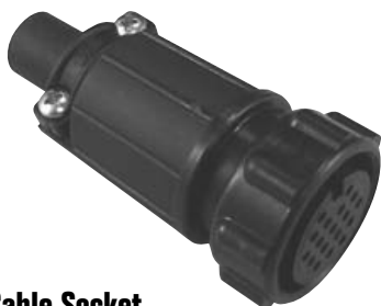
Cable Socket 13X8X-XXSG-XXX Matching Mates: • Cable-Cable 15X8X-XXPG-XXX • Panel 14XXX-XXPG-XXX