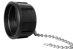
Receptacle Cap 4XX95