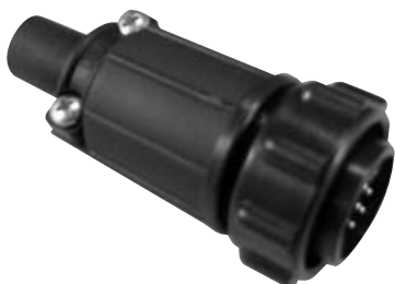
Cable Pin 13X8X-XXPG-XXX Matching Mates: • Cable-Cable 15X8X-XXSG-XXX • Panel 14XXX-XXSG-XXX