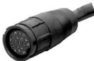
Cable to Cable