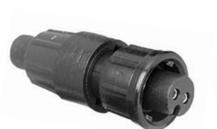
Cable Socket 1628X-XSB-XXX Matching Mates: • Cable-Cable 1828X-XPB-XXX • Panel 172XX-XPB-XXX