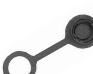
Dust Cap 16295