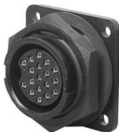
Panel Mount 14X8X-XXXG-XXX Matching Mates: • Cable Pin 13X8X-XXPG-XXX • Cable Socket 13X8X-XXSG-XXX