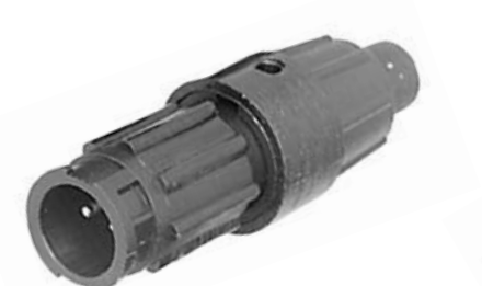
Cable to Cable 1828X-XXB-XXX Matching Mates: • Cable Pin 1628X-XPB-XXX • Cable Socket 1628X-XSB-XXX