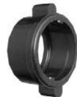
Winged Coupling Ring W/4482