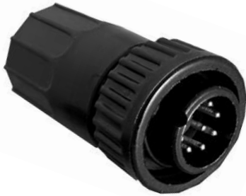
Cable Pin 3X8X-XPB-XXX Matching Mates: • Cable-Cable 5X8X-XSB-XXX • Panel 4XXX-XSB-XXX