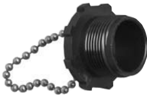
Cable Cap 4XX96