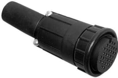
Cable Socket 23X8X-XXSG-XXX Matching Mate: • Panel 24XXX-XXPG-XXX