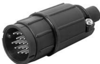
Cable to Cable 15X8X-XXXG-XXX Matching Mates: • Cable Pin 13X8X-XXPG-XXX • Cable Socket 13X8X-XXSG-XXX