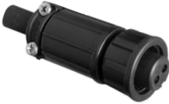
Cable Socket CXX 3106A XXXX XX S XXX