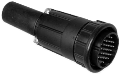
Cable Pin 23X8X-XXPG-XXX Matching Mate: • Panel 24XXX-XXSG-XXX