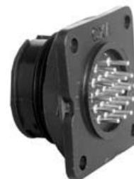
P/C Tail Panel Mount 14XXX-XXXG-XXX Matching Mates: • Cable Pin 13X8X-XXPG-XXX • Cable Socket 13X8X-XXSG-XXX