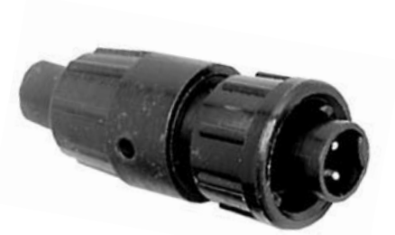
Cable Pin 1628X-XPB-XXX Matching Mates: • Cable-Cable 1828X-XSB-XXX • Panel 172XX-XSB-XXX