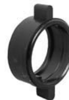
Winged Coupling Ring W/14482