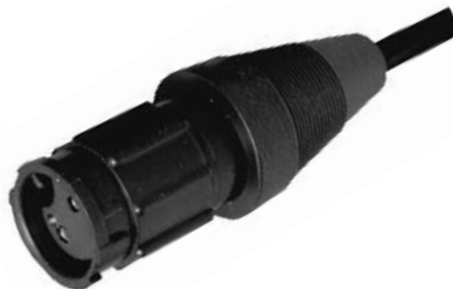
Cable to Cable