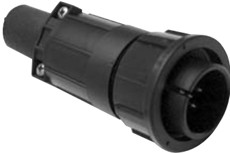
Cable Pin CXX 3106A XXXX XX P XXX