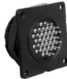
P/C Tail Panel Mount 24XXX-XXXG-XXX Matching Mates: • Cable Pin 23X8X-XXPG-XXX • Cable Socket 23X8X-XXSG-XXX