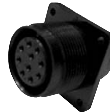
Box Receptacle Socket CXX 3102A XXXX XX S XXX