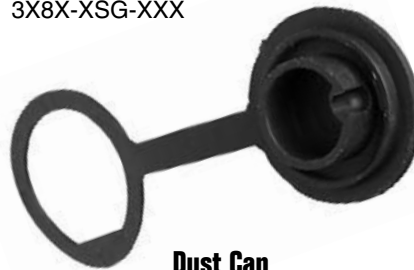
Dust Cap 4295