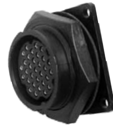
Panel Mount 24XXX-XXXG-XXX Matching Mates: • Cable Pin 23X8X-XXPG-XXX • Cable Socket 23X8X-XXSG-XXX