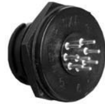
P/C Tail Panel Mount 4XXX-XXB-XXX Matching Mates: • Cable Pin 3X8X-XPB-XXX • Cable Socket 3X8X-XSB-XXX