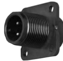
Box Receptacle Pin CXX 3102A XXXX XX P XXX