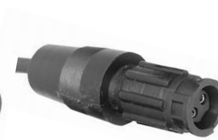
Cable to Cable