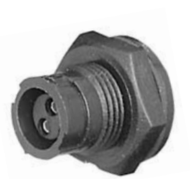
Panel Mount 1728X-XXB-XXX Matching Mates: • Cable Pin 1628X-XPB-XXX • Cable Socket 1628X-XSB-XXX