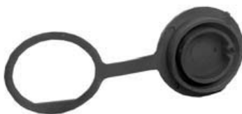
Dust Cap 14295