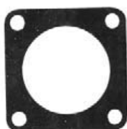
Square Flange Gasket 4297