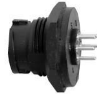
P/C Tail Panel Mount 7XXX-XXB-XXX Matching Mates: • Cable Pin 6X8X-XPB-XXX • Cable Socket 6X8X-XSB-XXX