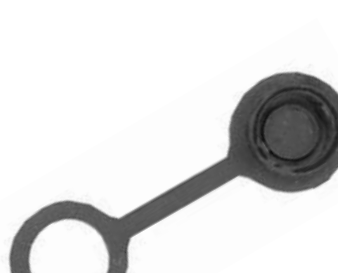
Dust Cap 16295