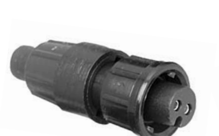
Cable Socket 1628X-XSB-XXX Matching Mates: • Cable-Cable 1828X-XPB-XXX • Panel 172XX-XPB-XXX