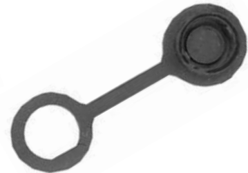
Dust Cap 16295