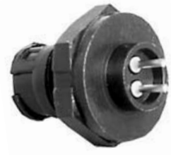
P/C Tail Panel Mount 172XX-XXB-XXX Matching Mates: • Cable Pin 1628X-XPB-XXX • Cable Socket 1628X-XSB-XXX