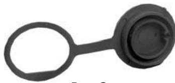
Dust Cap 14295