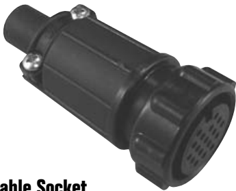
Cable Socket 13X8X-XXSG-XXX Matching Mates: • Cable-Cable 15X8X-XXPG-XXX • Panel 14XXX-XXPG-XXX