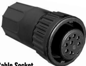
Cable Socket 3X8X-XSB-XXX Matching Mates: • Cable-Cable 5X8X-XPB-XXX • Panel 4XXX-XPB-XXX