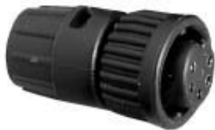
Cable Socket 6X8X-XSB-XXX Matching Mates: • Cable-Cable 8X8X-XPB-XXX • Panel 7XXX-XPB-XXX