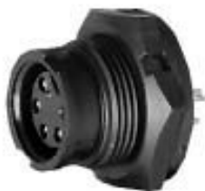
Panel Mount 7X8X-XXB-XXX Matching Mates: • Cable Pin 6X8X-XPB-XXX • Cable Socket 6X8X-XSB-XXX