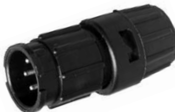
Cable to Cable 8X8X-XXB-XXX Matching Mates: • Cable Pin 6X8X-XPB-XXX • Cable Socket 6X8X-XSB-XXX