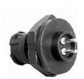
P/C Tail Panel Mount 172XX-XXB-XXX Matching Mates: • Cable Pin 1628X-XPB-XXX • Cable Socket 1628X-XSB-XXX