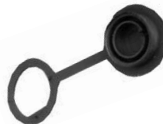
Dust Cap 6295