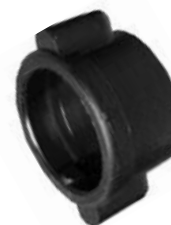
Winged Coupling Ring W/6482