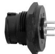
P/C Tail Panel Mount 7XXX-XXB-XXX Matching Mates: • Cable Pin 6X8X-XPB-XXX • Cable Socket 6X8X-XSB-XXX