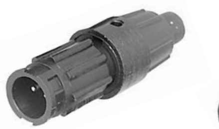
Cable to Cable 1828X-XXB-XXX Matching Mates: • Cable Pin 1628X-XPB-XXX • Cable Socket 1628X-XSB-XXX