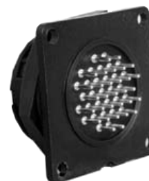
P/C Tail Panel Mount 24XXX-XXXG-XXX Matching Mates: • Cable Pin 23X8X-XXPG-XXX • Cable Socket 23X8X-XXSG-XXX