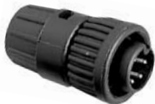
Cable Pin 6X8X-XPB-XXX Matching Mates: • Cable-Cable 8X8X-XSB-XXX • Panel 7XXX-XSB-XXX