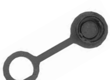
Dust Cap 16295