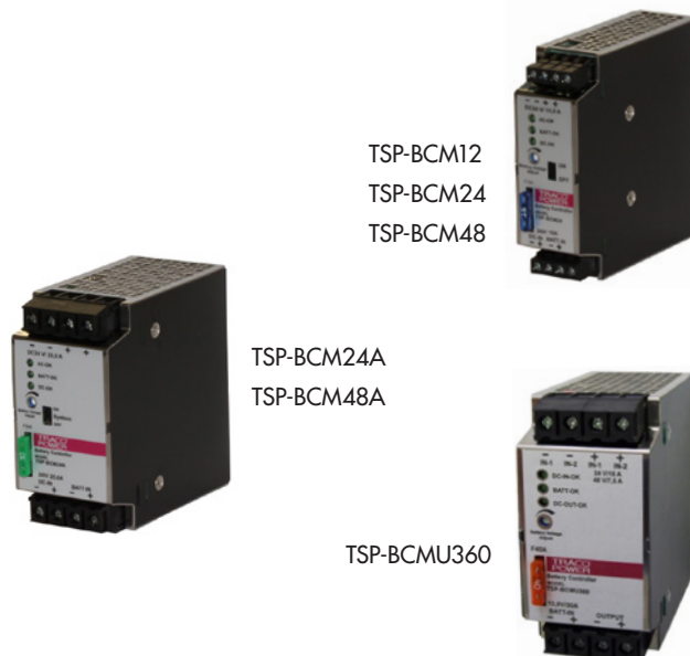
TSP-BCM12 TSP-BCM24 TSP-BCM48