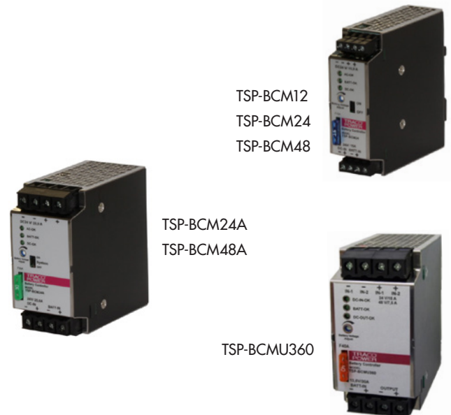
TSP-BCM12 TSP-BCM24 TSP-BCM48