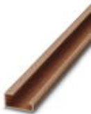
G-profile DIN rail, material: Copper, unperforated, height 15 mm, width 32 mm, length 2 m

DIN rail - NS 32 CU/35QMM UNPERF 2000MM - 1201358