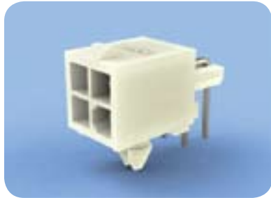
Right Angle Pin Header