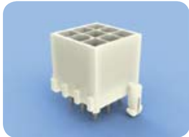
Vertical Pin Header