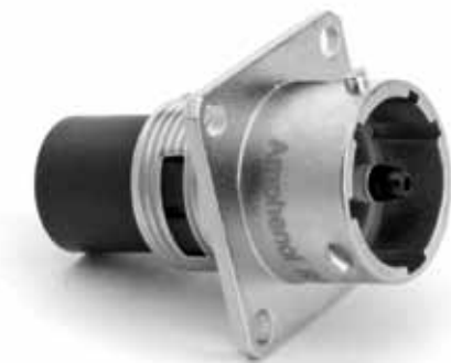
Part Number: RTHP0121PNH-16C