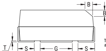
ANODE (+) END VIEW