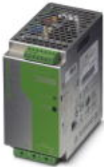
DIN rail power supply unit 24 V DC/5 A, primary switched-mode, 3-phase.

Please be informed that the data shown in this PDF Document is generated from our Online Catalog. Please find the complete data in the user's documentation. Our General Terms of Use for Downloads are valid ( http://phoenixcontact.com/download )