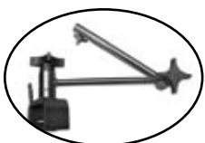
Splice Head Holder 4041-SH

Additional splicing head and "T" bar support for use with the MS 2 system.