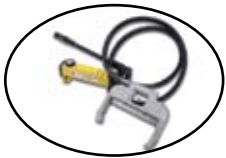
Hand/Hydraulic Crimping Unit 4031

Designed for high-volume module termination and uses air or nitrogen supply. An air cylinder or compressor with output pressure of 6.33–7.03 kg/cm (90–100 PSI) must be used. The unit is either hand- or foot-operated.