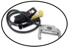
Air/Hydraulic Crimping Unit 4030

Durable, easy to transport tool box with tray. 66 x 29.2 x 28.2 cm (26 x 11.5 x 11.1") Cube: 9.8 kg. (21.7 lbs.) Ctn. size: 67.1 x 30 x 58.4 cm (26.4 x 11.8 x 23")