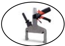
Hand Crimper 4036-25

Designed to hold a 4041-P splicing head in aerial splicing applications. Anchored to the suspension strand, the strand clamps behind and below the splice bundle and can be used with strands from 5 mm (3/16") diameter to 10 mm (3/8").