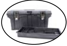
Tool Box with Modified Tray 4028-A

Used to mount the 4040 splicing head assembly in tight situations.