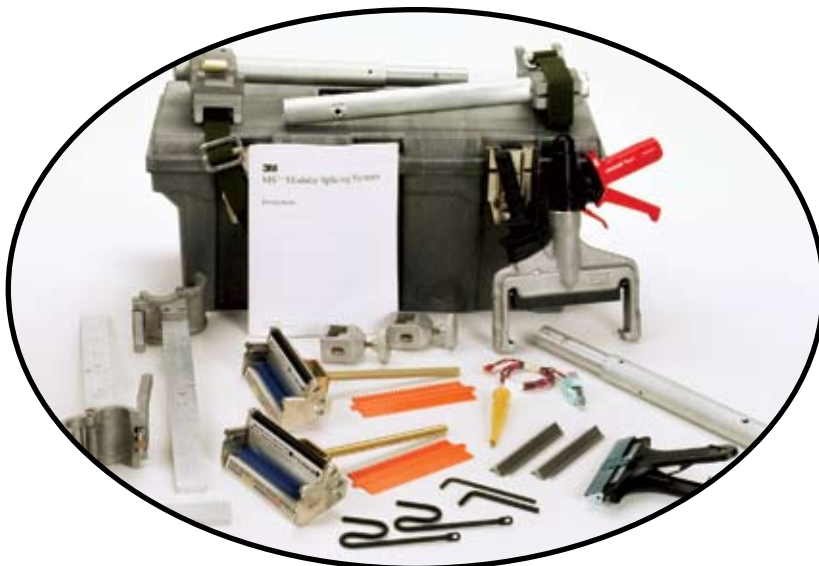
The 3M™ MS™ Splicing Rig 4021-M2/36/NXG is a complete splicing rig designed for one- or two-person fold-back or inline splicing.