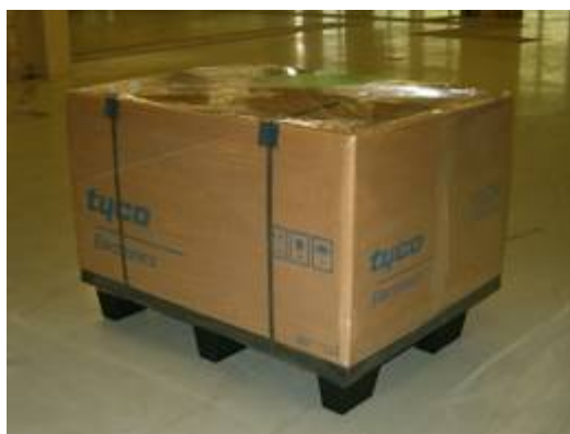
Fig. 1: Proper packing of relays for transportation

In transit, care has to be taken to avoid excessive shock and vibration. Mechanical stress can lead to changes in operating characteristics or to internal damage of the relay (see vibration and shock resistance). If mechanical stress is suspected, the relay should be checked and tested before use. Whenever relays arrive in damaged boxes at customer sides, there is a potential risk of transportation damage.