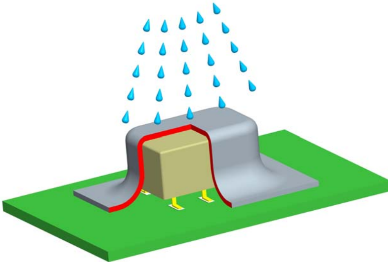
Fig. 4: Coating of relays on PCB's

Suitable are Epoxy, Urethane and Fluorine coatings. Absolutely forbidden are Silicone coatings.