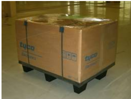
Fig. 1: Proper packing of relays for transportation

In transit, care has to be taken to avoid excessive shock and vibration. Mechanical stress can lead to changes in operating characteristics or to internal damage of the relay (see vibration and shock resistance). If mechanical stress is suspected, the relay should be checked and tested before use. Whenever relays arrive in damaged boxes at customer sides, there is a potential risk of transportation damage.