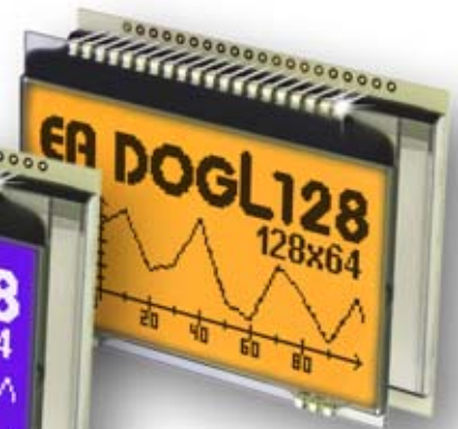
EA DOGL128W-6 + EA LED68x51-A