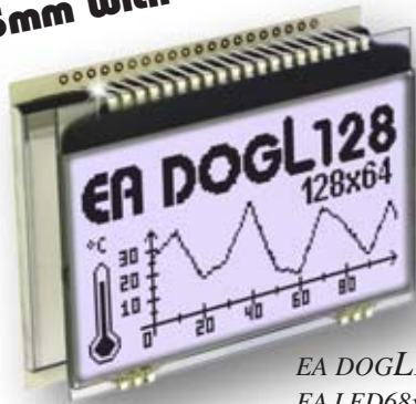
EA DOGL128W-6 + EA LED68x51-W

also available in low quantities ! flat: 6.5mm with LED B/L mounted