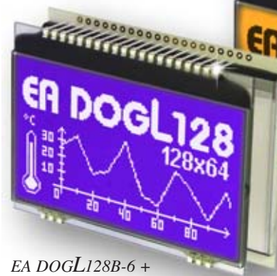
EA DOGL128B-6 + EA LED68x51-W