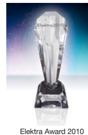
Elektra Award 2010