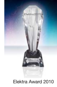
Elektra Award 2010